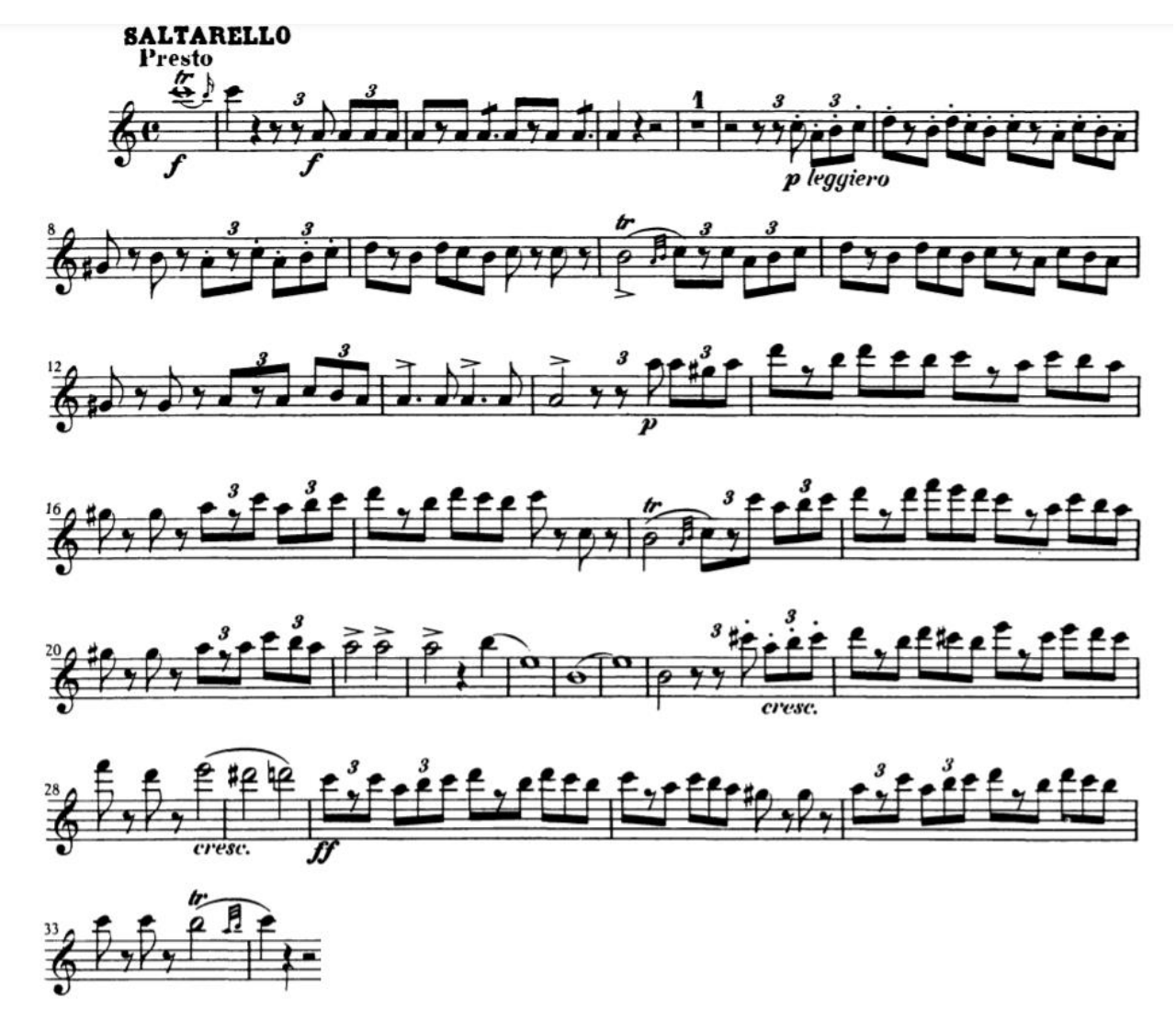
Symphony No 4 Mvt 4 – 2^{nd} Fl *

Please prepare sections marked in brackets [] where indicated. If no brackets are marked please prepare entire excerpt.