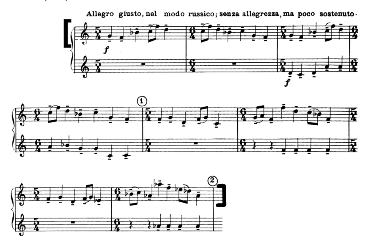
Trumpet 1 | In C

Please prepare sections marked in brackets [ ] where indicated. If no brackets are marked please prepare entire excerpt.