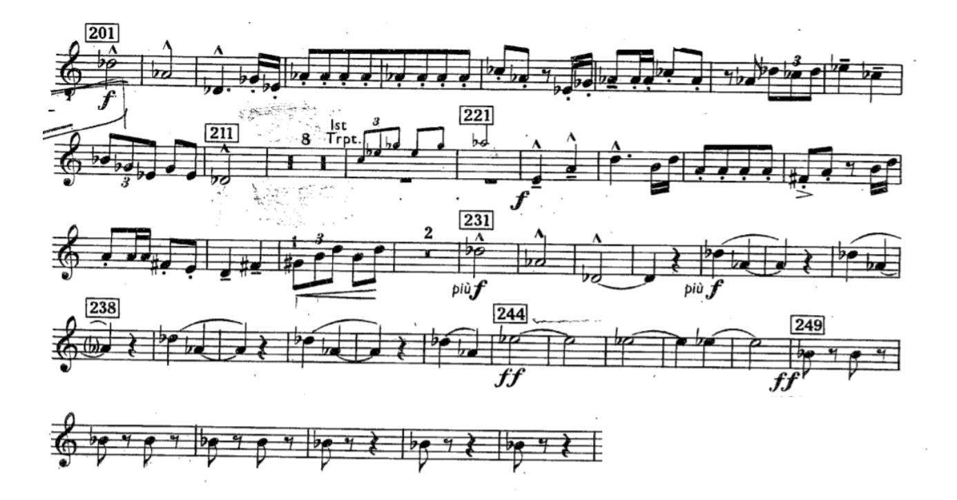
Concerto for Orchestra Mvt 5 – 2^{nd} Tpt in C^*

Please prepare sections marked in brackets [] where indicated. If no brackets are marked please prepare entire excerpt.