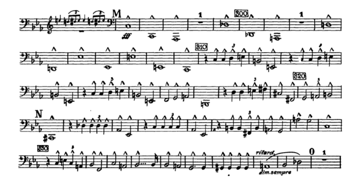
Symphony No. 4 Mvt 4