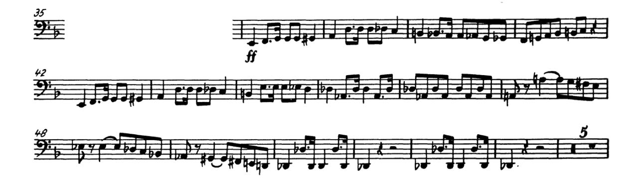
Symphony No. 4 Mvt 4